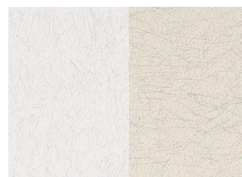
Gray Graphite GA6001FT (95.0%)

Nevamar Conductive Flooring is manufactured to order using the same procedures employed in the production of standard Nevamar floor tile, incorporating process changes to construction of the surface and core. The special construction of the surface sheet offers a distinctive pattern and is available in two color variations.